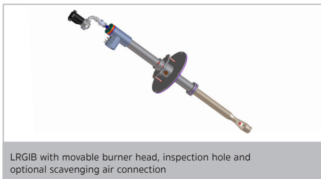
LRGIB with movable burner head, inspection hole and optional scavenging air connection